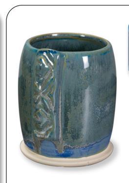
SW-184 Speckled Toad over SW-109 Capri Blue