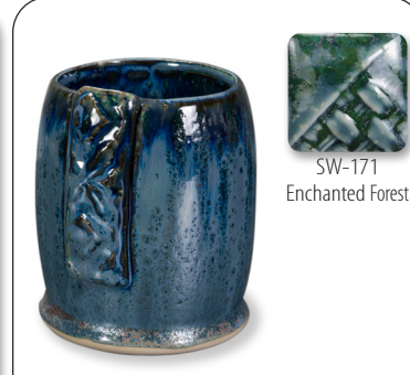
SW-184 Speckled Toad over <u>SW-171 E</u>nchanted Forest