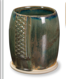
SW-184 Speckled Toad over SW-173 Amber Quartz