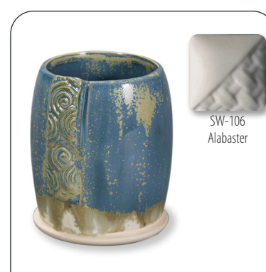
SW-184 Speckled Toad over SW-106 Alabaster

Then apply two (2) layers of top glaze (SW-184 Speckled Toad), letting glazes dry between coats.