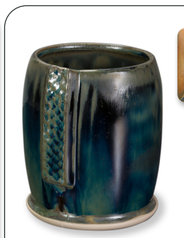
SW-184 Speckled Toad over SW-173 Amber Quartz