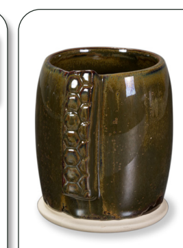
SW-112 Tiger's Eye