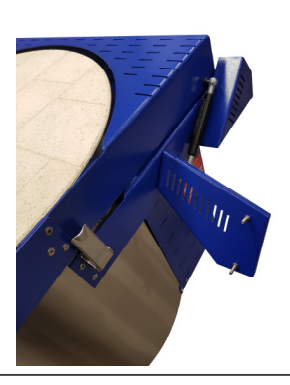
Fig Fig. 2.4 2.5

Use the 2 pins provided to hold the controller holster whilst the fixing screws for the kiln bracket are already screwed into position on the kiln. See Fig. 2.4.