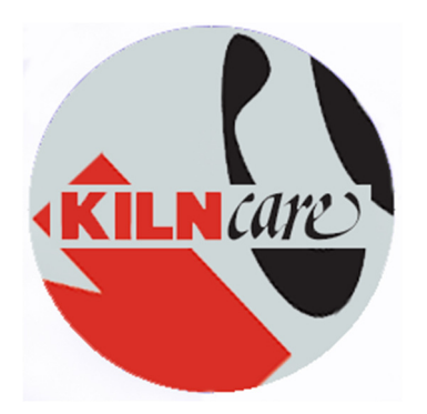
IKON Range Instruction manual. 2022

Want regular updates, offers and future sneak peaks? Like and follow us on Facebook Follow us and #kilncare on instagram Follow us on twitter