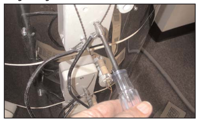
Untightening the element terminal:

5) Cut the old elements off as close to the "through hole" on the outside of the kiln as possible. You want a straight element tail to pull through the through hole, not a crooked one.