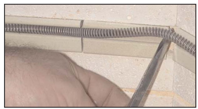
Lift Elements out of the groove of the ceramic holders:

Using a sharp tool like a screw driver lift the elements out of the ceramic grooves at the corners. You can slide the holder over to make enough of a gap to get the tool under the element: