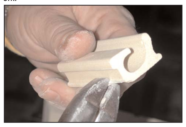
A normal holder compared to one with edge removed:

Using Linemen's Pliers snap off the BOTTOM edge of the holder (note carefully the fact that the BOTTOM of the groove is closest to the edge that you are breaking off.: