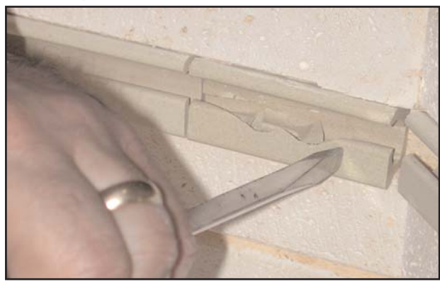
The holder shown with about half the job done:

Just take your time with this. You can break the holder into little pieces so that it comes out: