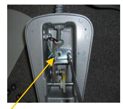
3.Loosen the two screws connecting the potentiometer bracket to the foot pedal housing