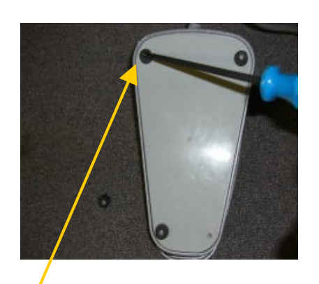
1.Unscrew the 4 feet using the Phillips screwdriver