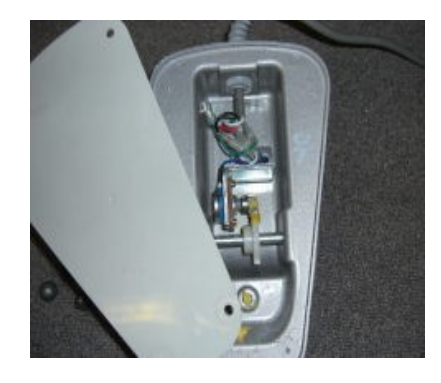
2.Remove the cover and Make sure the pedal is in the stop position and the power is on