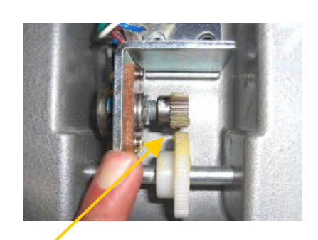
4. Move the potentiometer (silver gear) away from the white plastic gear so they are not touching